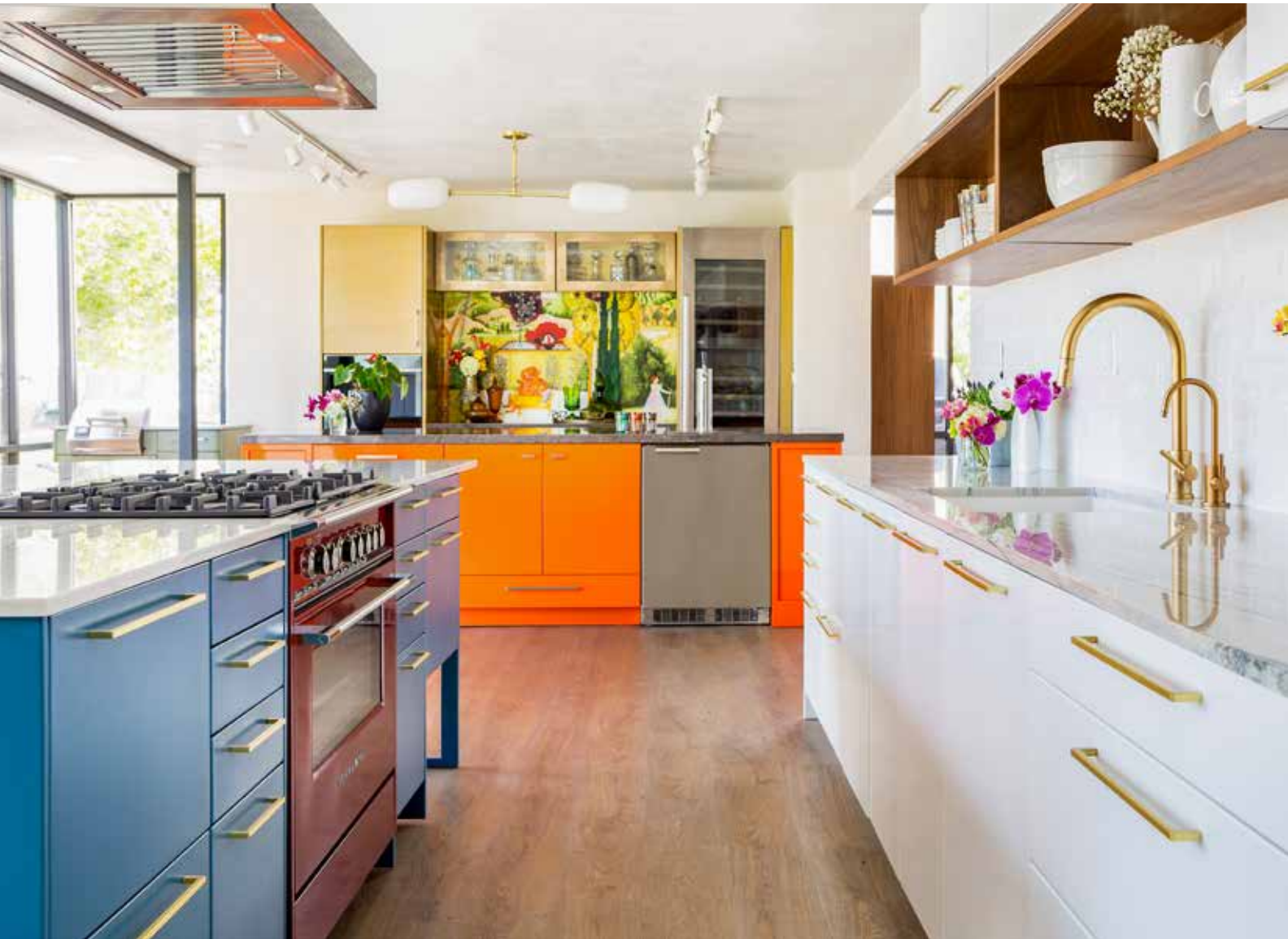
Moya Living + Event Center adjacent to our manufacturing facility. Located in Orange County, California.