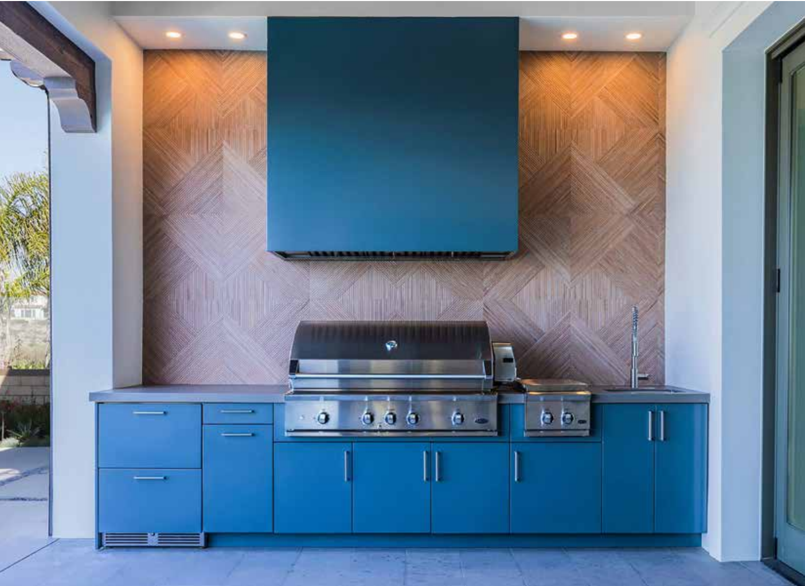
Outdoor living with matching Bentley Blue cabinetry + vent hood at this San Clemente, California home.