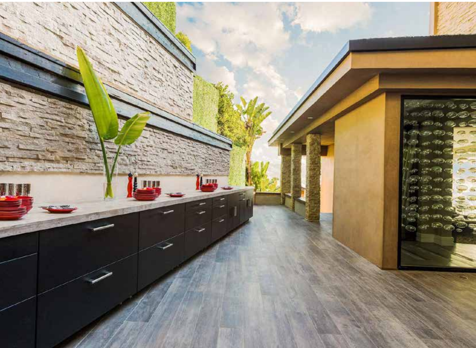
Outdoor cabinetry for entertainers home in Laguna Beach, California. Shown is a baked on power coat on stainless steel in Jet Black.