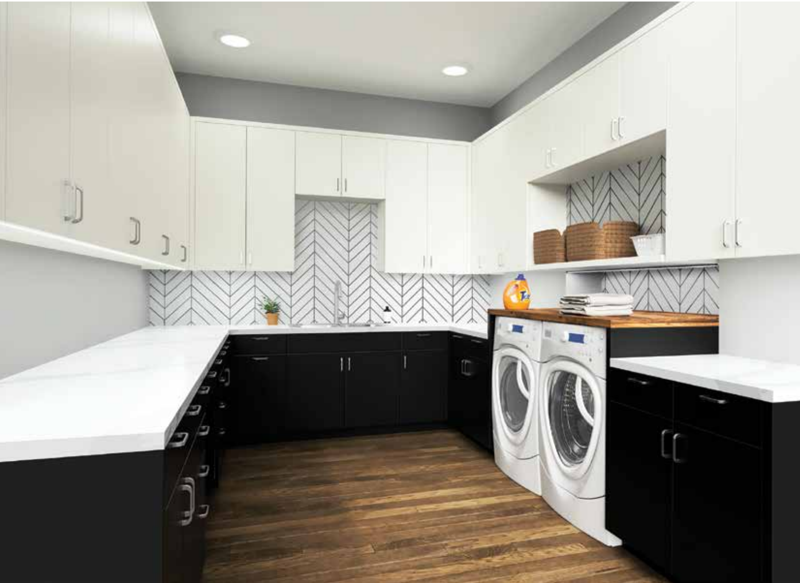
Luxurious laundry room - beautiful Jet Black cabinets with Polar White uppers add for a striking contrast for our Houston, Texas client.