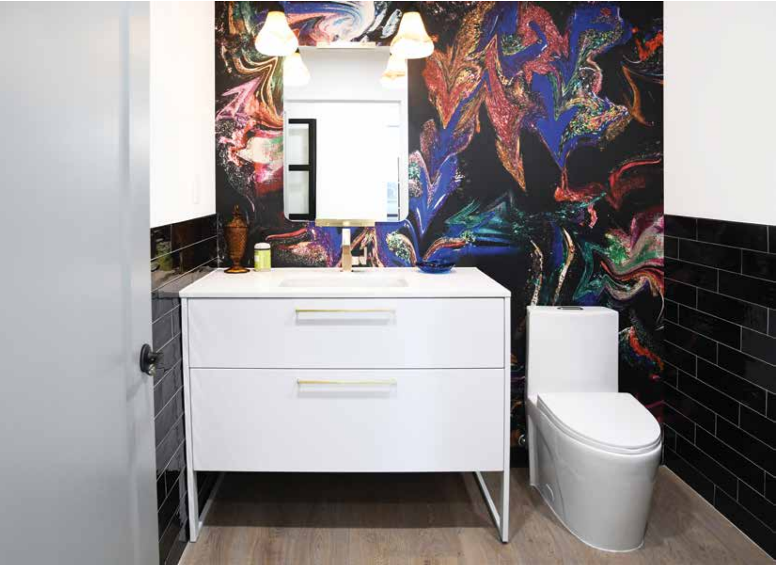
Sleek 2 drawer powder coated Polar White vanity is a nice contrast with the black subway tiles and custom wallpaper.